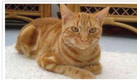
Dexter (Ginger) very happy in his new home

trapped and reunited with her siblings. After a few weeks of intensive care the kittens had come on well enough to move to a foster home where they stayed for over a month before coming to the Sanctuary. Freda and her kittens have now all been rehomed, and despite their shaky start in life are all settling well into their new families.